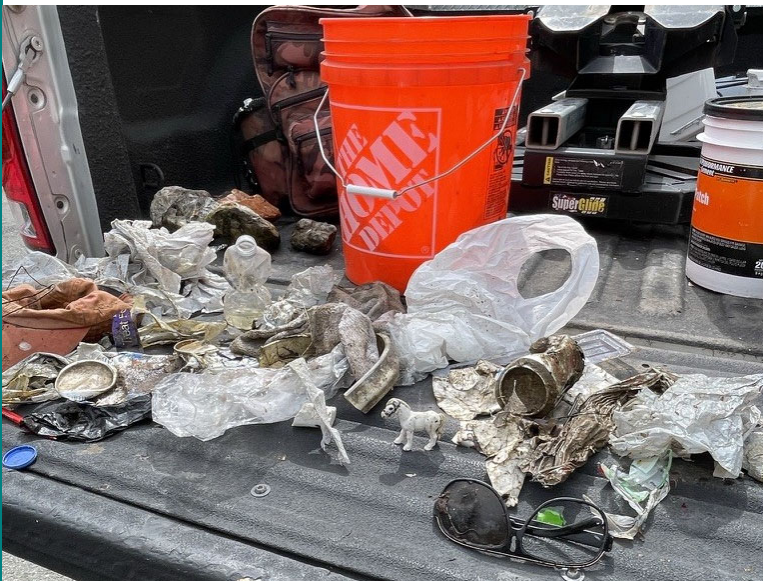
Some of the trash removed from the creek and an interesting jasper find.