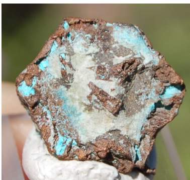
Pseudomorph Copper after Aragonite

POLYMORPH REFERS TO FOUR OR MORE MINERAL SPECIES THAT HAVE THE SAME CHEMICAL FORMULA. SILICON DIOXIDE (SiO 2 ) IS A GREAT EXAMPLE. QUARTZ CRYSTALLIZES IN THE TRIGONAL SYSTEM, TRIDYMIT CRYSTALLIZES IN THE ORTHORHOMBIC SYSTEM, CRISTOBALITE CRYSTALLIZES IN THE TETRAGONAL SYSTEM, COESITE CRYSTALLIZES IN THE MONOCLINIC SYSTEM, AND STISHOVITE CRYSTALLIZES IN THE TETRAGONAL SYSTEM— AND THEY ALL HAVE THE SAME CHEMICAL FORMULA! ROCK AND GEM