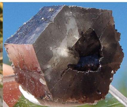
Dimorph, Aragonite and Calcite