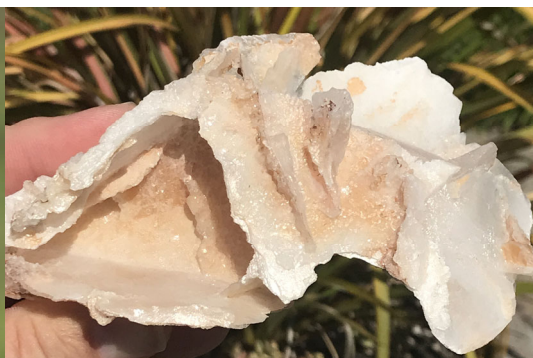
Epimorph Calcite shell