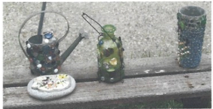
Examples of their work