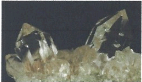
Himalayan Quartz, Himachal Pradesh, India at ~15k feet. Optical clarity ( basically, water clear). Very impressive – I haven't been this excited about quartz in a long time! And I traded this one back for a bigger specimen.

Matt will talk about methods to help us take better photos of our collections. "These things we love can be surprisingly difficult to photograph as they reflect and refract, turn partly invisible, and sometimes even glare at you!", he says. "But, you can take good photographs, even with inexpensive equipment."