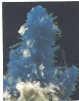
Pentgonite with Calcite: India. Specimen is 1-3/4" high by 1" wide at its widest point. Nikon D2X, 60mm Nikon micro lens with attached PK-11a, 12, and 13 extension rings to get as close as I could without a bellows. Photo was used in the 2009 Santa Clara Valley Gem & Mineral Society Gem Show promotion.