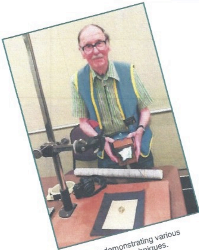
Barrie demonstrating various photography techniques.