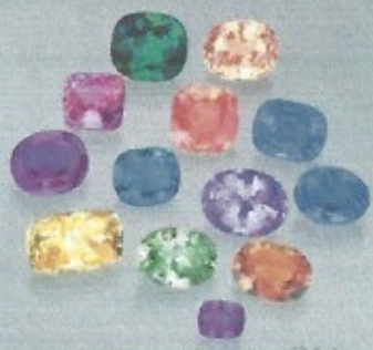
Photo: A spellbinding sight: the many colors of sapphire.

Learn about sapphires from GIA here: https://www.gia.edu/birthstones/september-birthstones