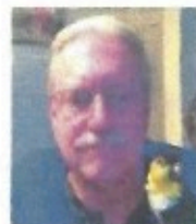
Upcoming Field Trips

Let me know if you'd like more information on these, or anything else.