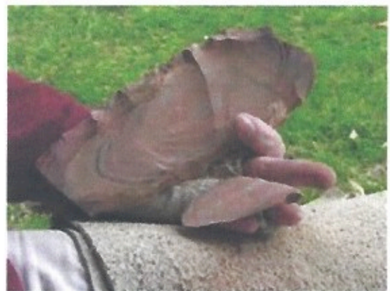
Clockwise from top: Rainbow obsidian, primitive knapping tool, beginning of a scrapper, finished spear point