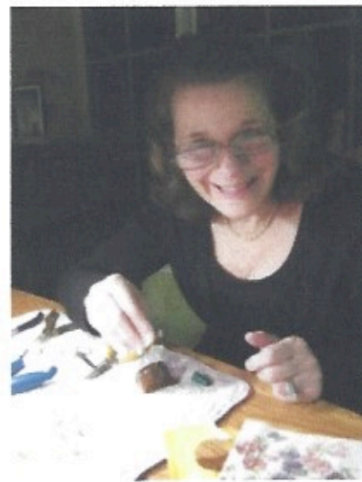
Ming trees made at May Beaders meeting