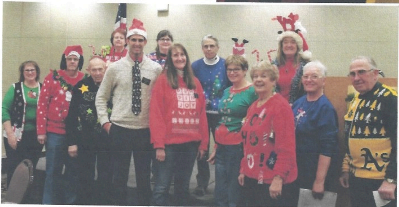
Above: Ugly Sweater Contestants paraded at the CCM&GS 2017 Christmas Dinner. So many great sweaters to choose from.....made it FUN for everyone!