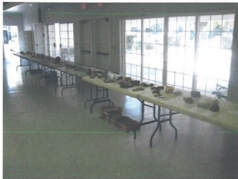
Silent auction table at NBFT meeting