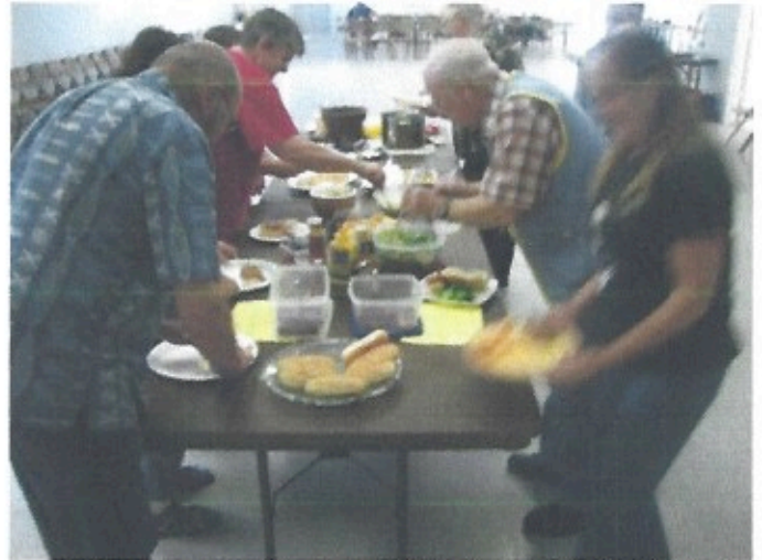
Lunch time at the NBFT meeting

NOVEMBER 22 & 23, 2014 SANTA CRUZ, CA 95062 3rd Annual Winter Rockin' Show! Santa Cruz Winter Mineral, Fossil, Jewelry Sale 10 am to 5 pm, Live Oak Grange Hall, 1700 17th Ave., Santa Cruz 95062 http://www.scmgs.org