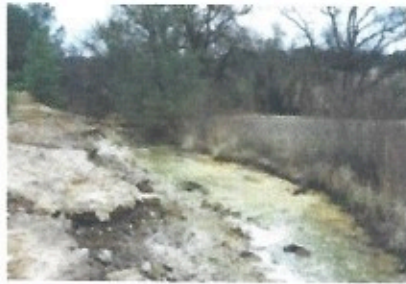
Spenceville Stream Before Reclamation.

Imagine enough battery acid to fill 625 swimming pools and enough toxic mine waste to fill 10,000 dump trucks. Now imagine having to clean that up!