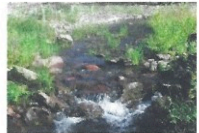
Spenceville Stream After Reclamation.