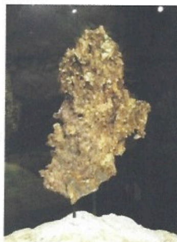
The Ironstone Crown Jewel gold nugget found in Jamestown, California on Christmas Day, 1992. At 44 pounds, this crystalline gold specimen is the world's largest.