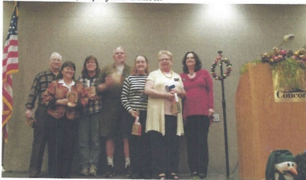
Installation of officers for 2013