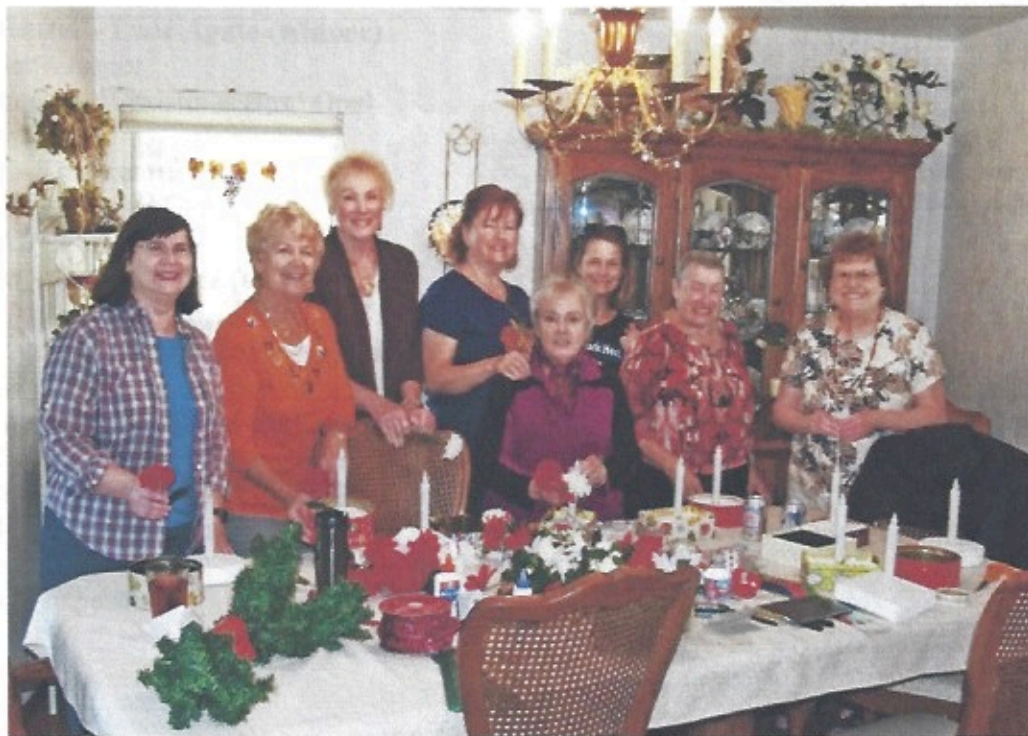
CCMGS decorations committee preparing decorations for the holiday party